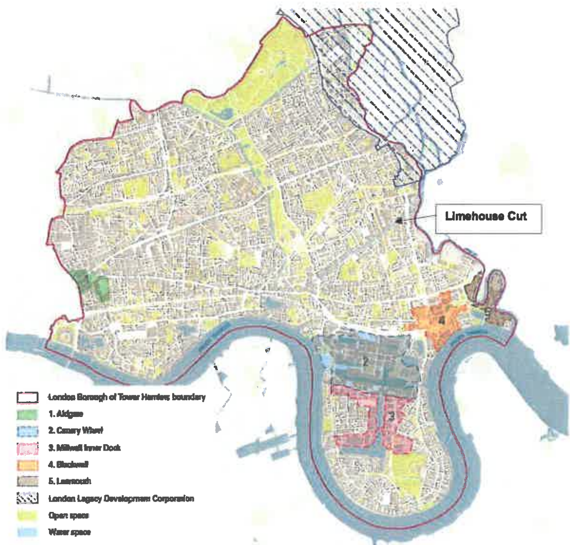
Figure 1.4: Local Plan Policy D.D16 - Tall Building Zones (Figure 7 as referenced in the policy wording)

A section of the Limehouse Cut lies within the Lower Lea Valley sub area as indicated below.