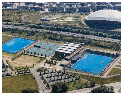
Lee Valley Hockey and Tennis Centre