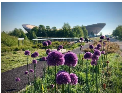
Lee Valley VeloPark