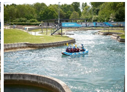
Lee Valley White Water Centre