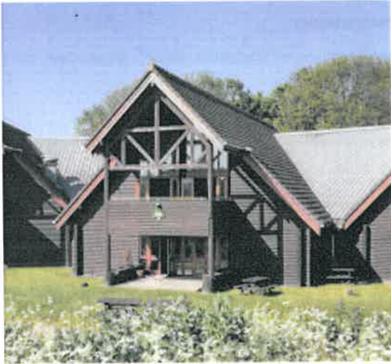
Lee Valley Youth Hostel